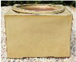
Fit 2\frac{3}{8} " grower pot

Item #: VNP70415 A To fit 8.1" grower pot Product Dimensions: 9.65" x 9.65" x H8.10" Product N.W: 8.82 Lbs Packing: 64 pcs/crate Crate Meas.: 49 cbf MOQ: 3 crates = 192 pcs, for max. 2 colors, 96 pcs per color