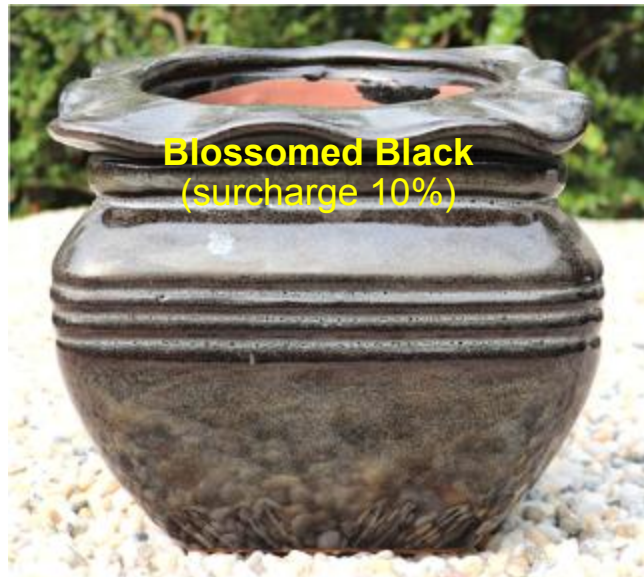
Blossomed Black (surcharge 10%)