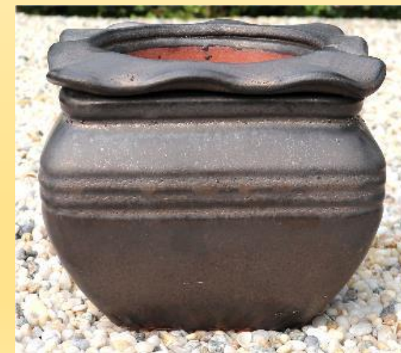
Fit 8" grower pot