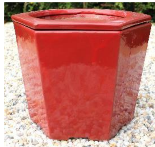
Fit 6" grower pot

Item #: VNP70413 B To fit 6" grower pot Product Dimensions: 8.45"Dia. x 5.90" Tall Product N.W: 4.40 Lbs Packing: 100 pcs/crate Crate Meas.: 49 cbf MOQ: 2 crates = 200 pcs, for max. 2 colors, 100 pcs per color