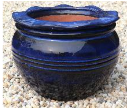
Fit 5.1" grower pot

Item #: VNP70417 C To fit 5.1" grower pot Product Dimensions: 7.30"Dia. x 5.30" Tall Product N.W: 3.64 Lbs Packing: 100 pcs/crate Crate Meas.: 35 cbf MOQ: 2 crates = 200 pcs, for max. 2 colors, 100 pcs per color