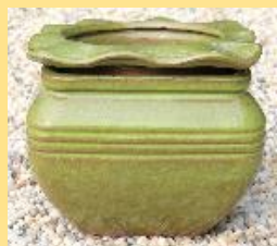
Fit 3" grower pot

Each style of Ceramic Self-watering Pot is designed to fit 5 sizes of US standard grower pots