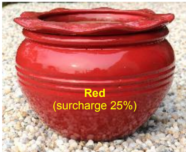
Red (surcharge 25%)