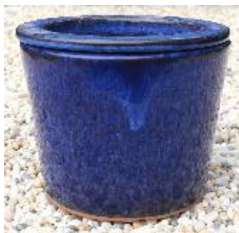
Fit 4" grower pot

Item #: VNP70412 D To fit 4" grower pot Product Dimensions: 5.90"Dia. x 4.55" Tall Product N.W: 2.20 Lbs Packing: 200 pcs/crate Crate Meas.: 35.5 cbf MOQ: 1 crate = 200 pcs, for max. 2 colors, 100 pcs per color