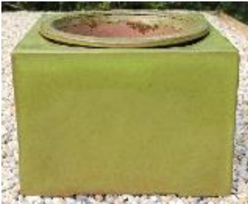
Fit 4" grower pot