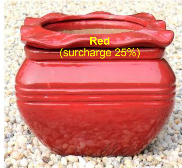
Red (surcharge 25%)