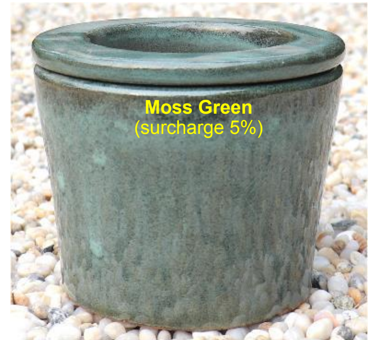
Moss Green (surcharge 5%)