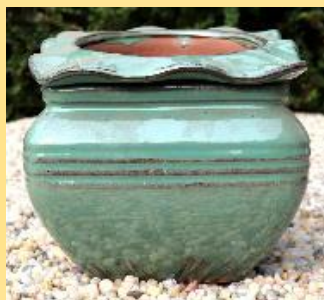
Fit 4" grower pot