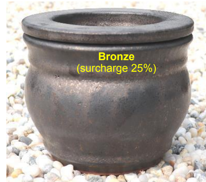
Bronze (surcharge 25%)