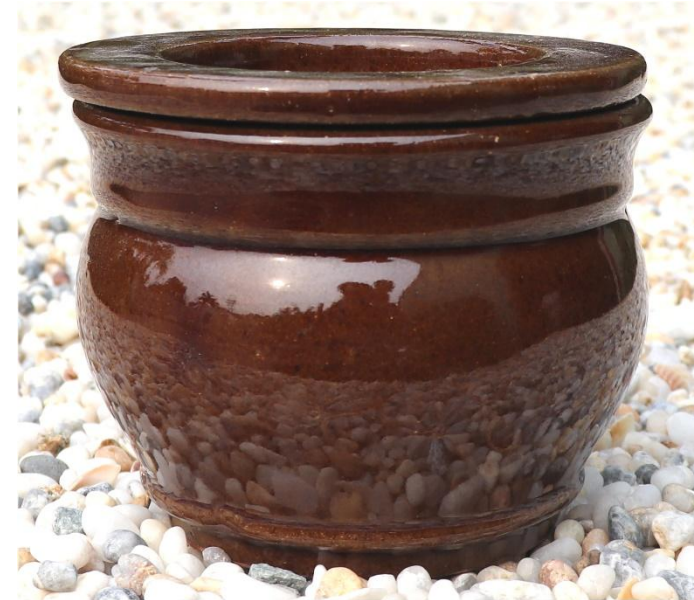
Fit 2 \frac{3}{8} " grower pot