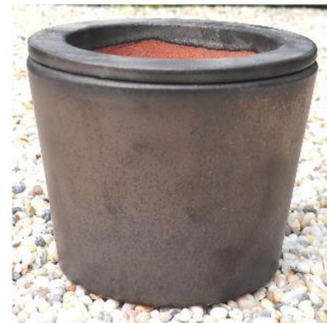
Fit 8.1" grower pot

Item #: VNP70412 A To fit 8.1" grower pot Product Dimensions: 9.65"Dia. x 7.90" Tall Product N.W: 8.16 Lbs Packing: 64 pcs/crate Crate Meas.: 35.5 cbf MOQ: 3 crates = 192 pcs, for max. 2 colors, 96 pcs per color