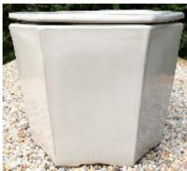
Fit 4" grower pot

Item #: VNP70413 D To fit 4" grower pot Product Dimensions: 6.30"Dia. x 4.35" Tall Product N.W: 2.20 Lbs Packing: 200 pcs/crate Crate Meas.: 42 cbf MOQ: 1 crate = 200 pcs, for max. 2 colors, 100 pcs per color