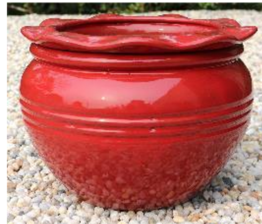
Fit 6" grower pot

Item #: VNP70417 B To fit 6" grower pot Product Dimensions: 9.05"Dia. x 6.30" Tall Product N.W: 4.85 Lbs Packing: 100 pcs/crate Crate Meas.: 49.5 cbf MOQ: 2 crates = 200 pcs, for max. 2 colors, 100 pcs per color