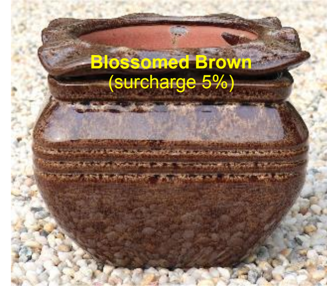
Blossomed Brown (surcharge 5%)

E size: to fit 2 \frac{3}{8} " grower pot