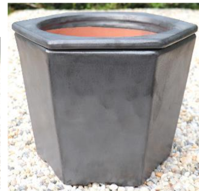
Fit 8.1" grower pot

Item #: VNP70413 A To fit 8.1" grower pot Product Dimensions: 11.0"Dia. x 7.90" Tall Product N.W: 8.16 Lbs Packing: 48 pcs/crate Crate Meas.: 43.5 cbf MOQ: 4 crates = 192 pcs, for max. 2 colors, 96 pcs per color