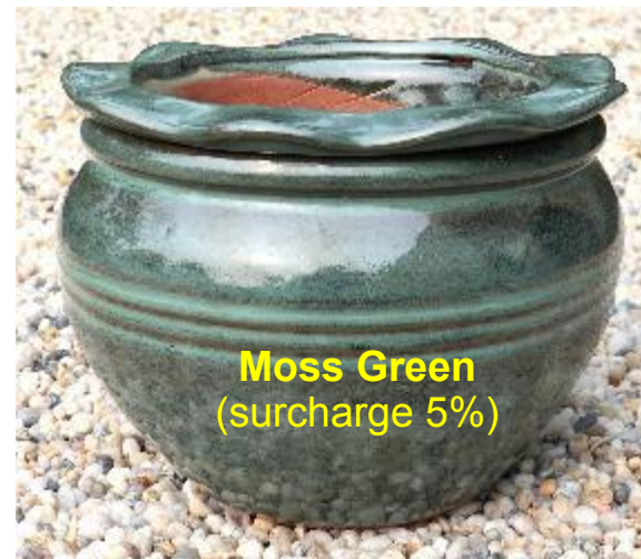
Moss Green (surcharge 5%)