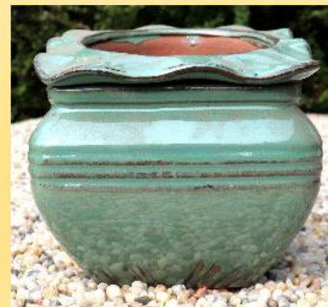
Fit 6" grower pot