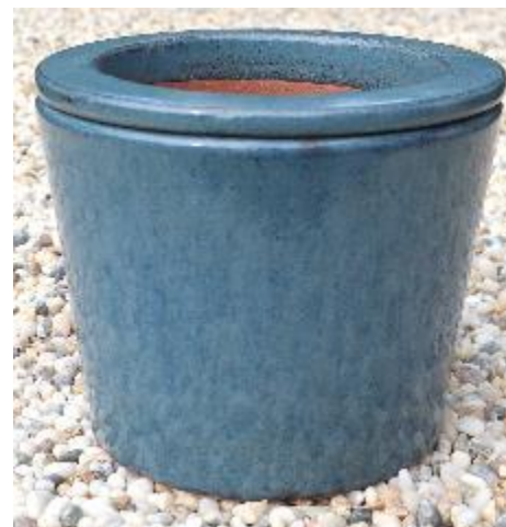
Fit 6" grower pot

Item #: VNP70412 B To fit 6" grower pot Product Dimensions: 7.50"Dia. x 5.70" Tall Product N.W: 4.40 Lbs Packing: 100 pcs/crate Crate Meas.: 35 cbf MOQ: 2 crates = 200 pcs, for max. 2 colors, 100 pcs per color