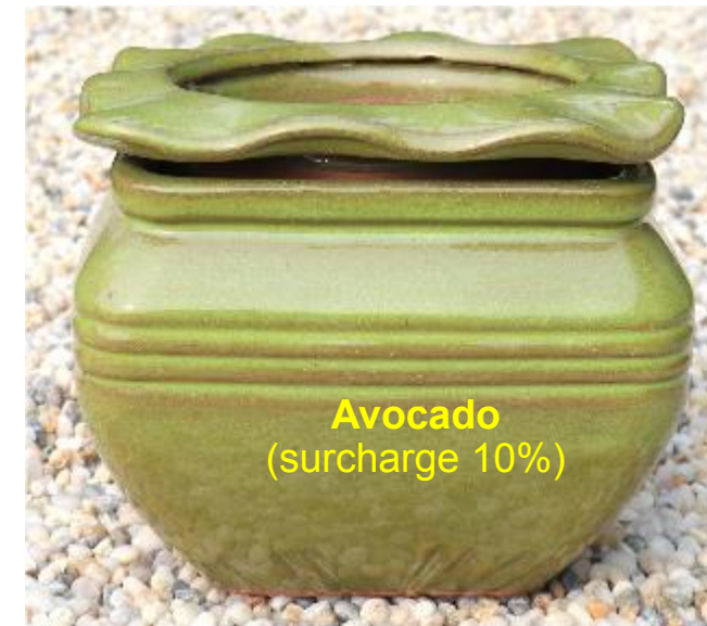
Avocado (surcharge 10%)