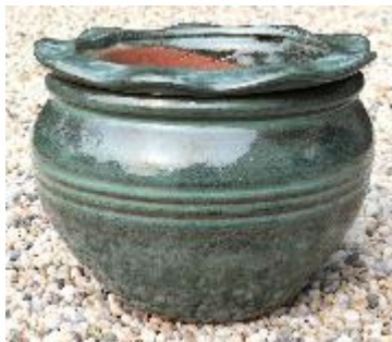
Fit 4" grower pot

Item #: VNP70417 D To fit 4" grower pot Product Dimensions: 6.30"Dia. x 4.75" Tall Product N.W: 2.65 Lbs Packing: 200 pcs/crate Crate Meas.: 39.5 cbf MOQ: 1 crate = 200 pcs, for max. 2 colors, 100 pcs per color