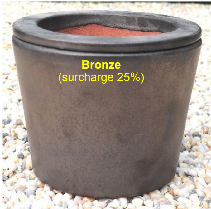
Bronze (surcharge 25%)