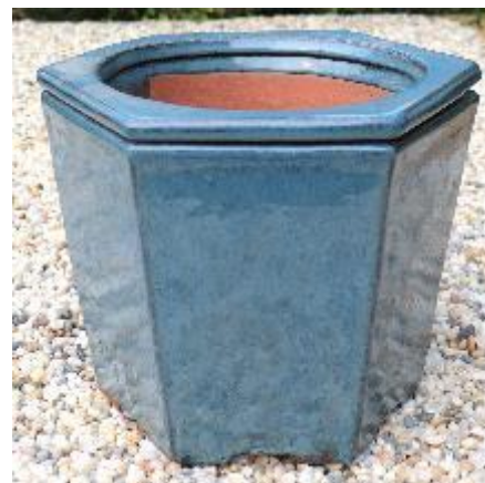
Fit 5.1" grower pot

Item #: VNP70413 C To fit 5.1" grower pot Product Dimensions: 7.50"Dia. x 4.90" Tall Product N.W: 3.30 Lbs Packing: 100 pcs/crate Crate Meas.: 32.5 cbf MOQ: 2 crates = 200 pcs, for max. 2 colors, 100 pcs per color