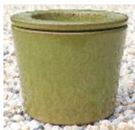
Fit 2 \frac{3}{8} " grower pot

Please choose the colors for this self-watering pot style in the next two pages