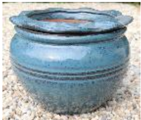
Fit 2 \frac{3}{8} " grower pot

Item #: VNP70417 E To fit 2 \frac{3}{8} " grower pot Product Dimensions: 4.35"Dia. x 3.55" Tall Product N.W: 1.76 Lbs Packing: 200 pcs/crate Crate Meas.: 16.5 cbf MOQ: 1 crate = 200 pcs, for max. 2 colors, 100 pcs per color