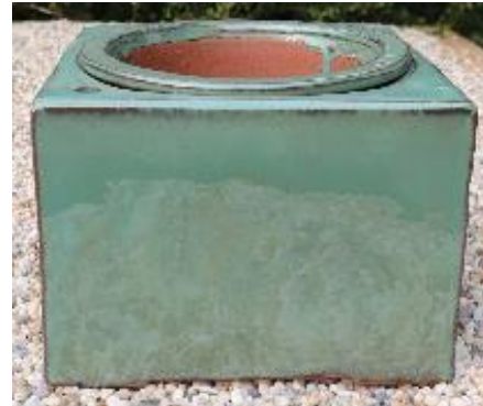
Fit 5.1" grower pot