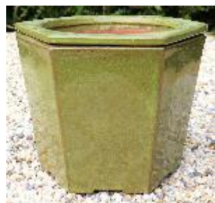
Fit 2\frac{3}{8} " grower pot

Item #: VNP70413 E To fit 2\frac{3}{8} " grower pot Product Dimensions: 4.75"Dia. x 2.95" Tall Product N.W: 1.10 Lbs Packing: 200 pcs/crate Crate Meas.: 17 cbf MOQ: 1 crate = 200 pcs, for max. 2 colors, 100 pcs per color