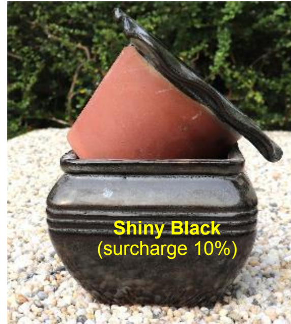
Shiny Black (surcharge 10%)