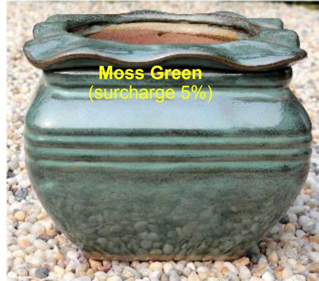
Moss Green (surcharge 5%)