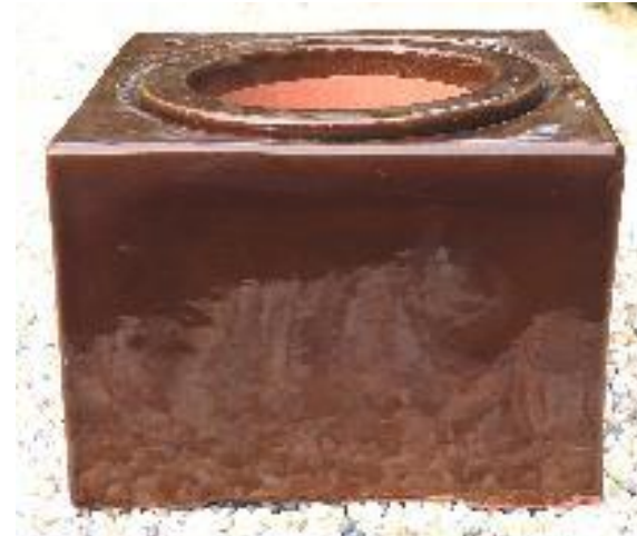
Fit 6" grower pot