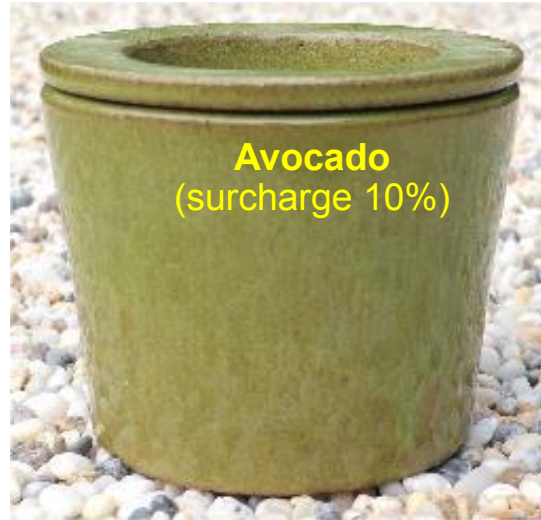
Avocado (surcharge 10%)