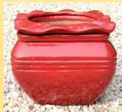
Fit 5.1" grower pot