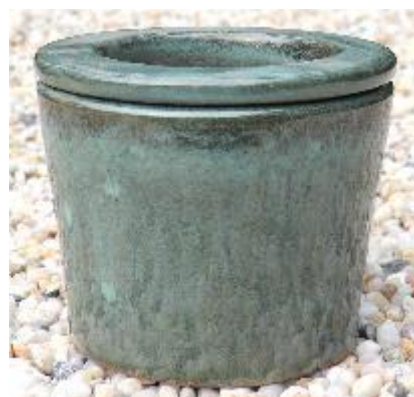
Fit 5.1" grower pot

Item #: VNP70412 C To fit 5.1" grower pot Product Dimensions: 6.70"Dia. x 5.30" Tall Product N.W: 3.30 Lbs Packing: 200 pcs/crate Crate Meas.: 46.5 cbf MOQ: 1 crate = 200 pcs, for max. 2 colors, 100 pcs per color