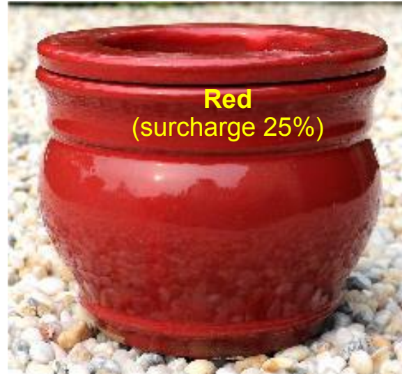
Red (surcharge 25%)