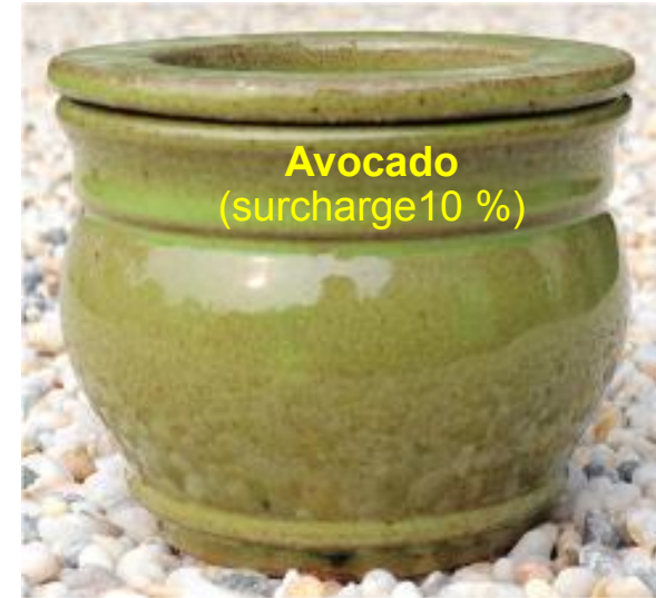
Avocado (surcharge 10 %)