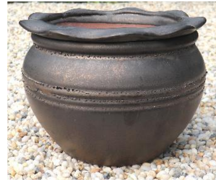
Fit 8.1" grower pot

Item #: VNP70417 A To fit 8.1" grower pot Product Dimensions: 11.45"Dia. x 7.90" Tall Product N.W: 6.60 Lbs Packing: 60 pcs/crate Crate Meas.: 56 cbf MOQ: 3 crates = 180 pcs, for max. 2 colors, 90 pcs per color