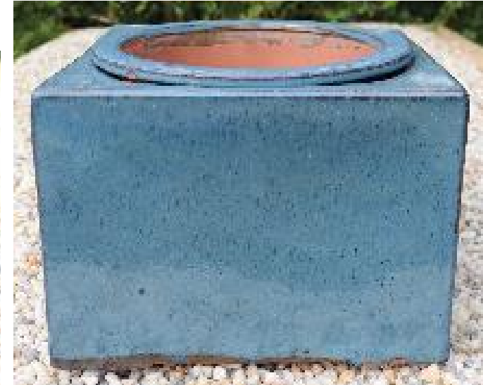
Fit 8.1" grower pot

Please choose the colors for this self-watering pot style in the next two pages